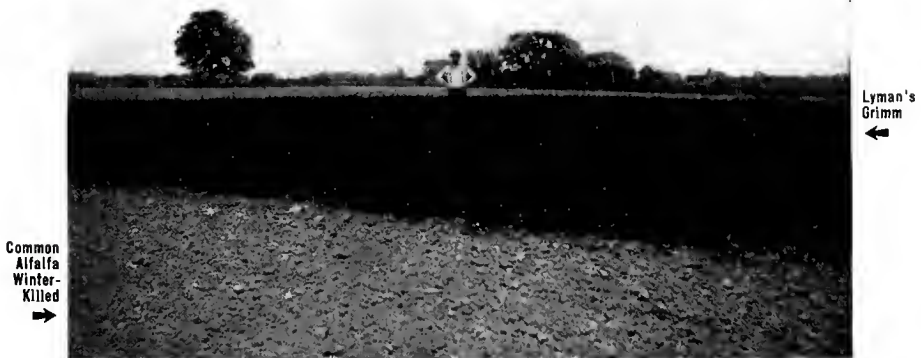
"A SURVIVAL OF THE FITTEST"