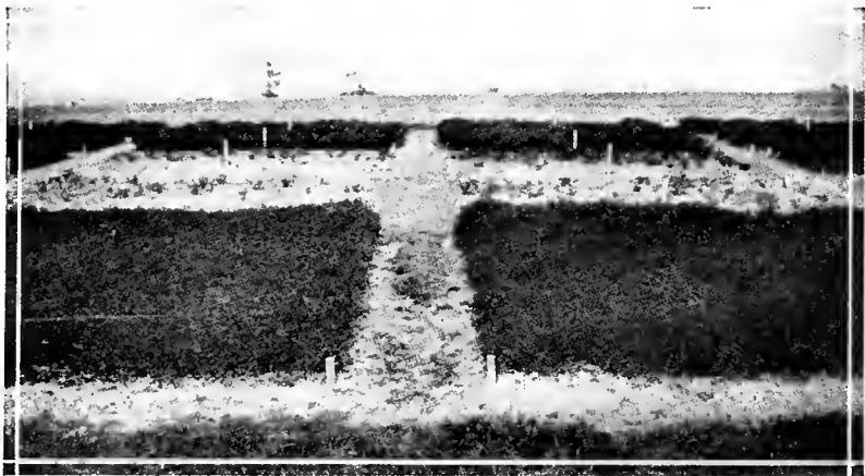
Grimm Compared with Common Alfalfa