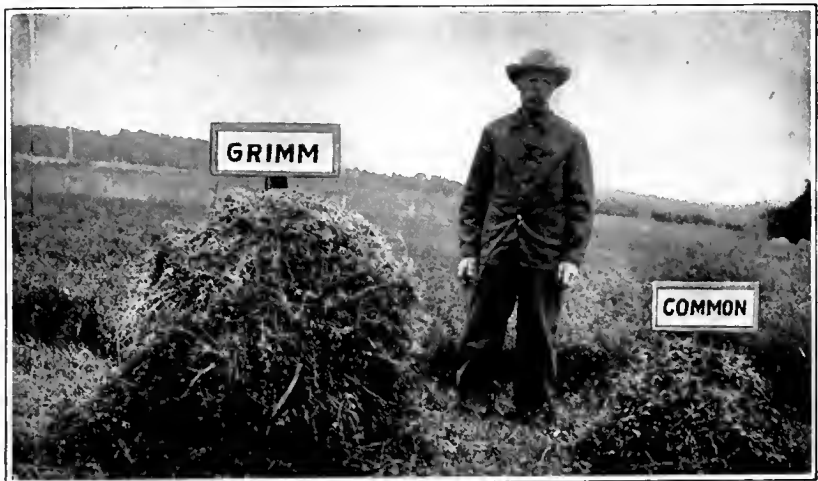
Showing Comparison of Harvests, Grimm with Common Alfalfa