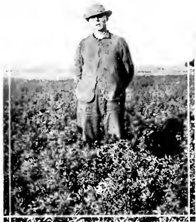
Showing the Leafy Quality of Grimm Alfalfa and Its Luxuriant Growth