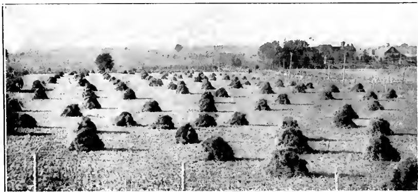
The above picture was taken from the top of a mound on the County Farm at Vernon County, Viroqua, Wisconsin, and shows the second cutting of Lyman's Grimm alfalfa that grew in 27 days. This field is four years old and withstood the winter in 1915 when other alfalfas and common clover were killed.