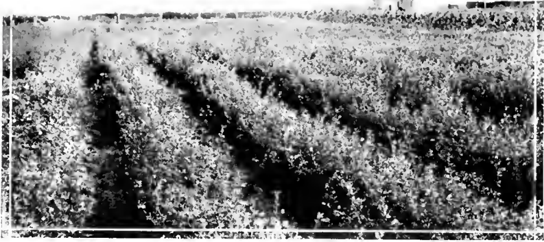
Grimm Alfalfa in Rows 30 Inches Apart at McLeod Demonstration Farm, North Dakota